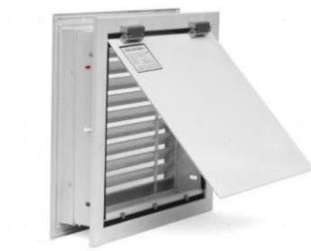
Fig.2: Pressure Relief Device